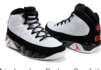
Air Jordan Retro 12 black ID:5160 Free Shipping